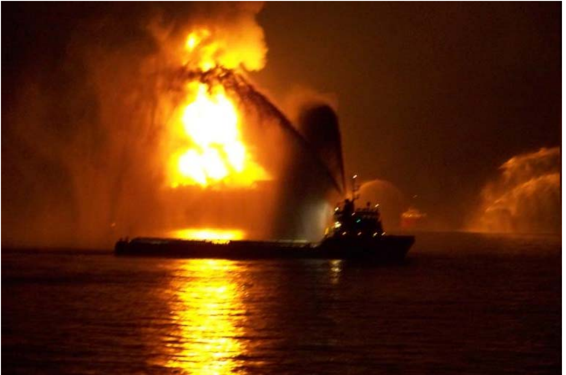
Support vessels using their fire fighting gear to cool the rig