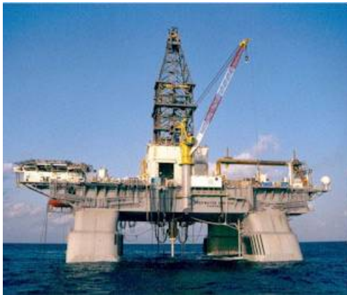
L and R, the Deepwater Horizon on location in better days