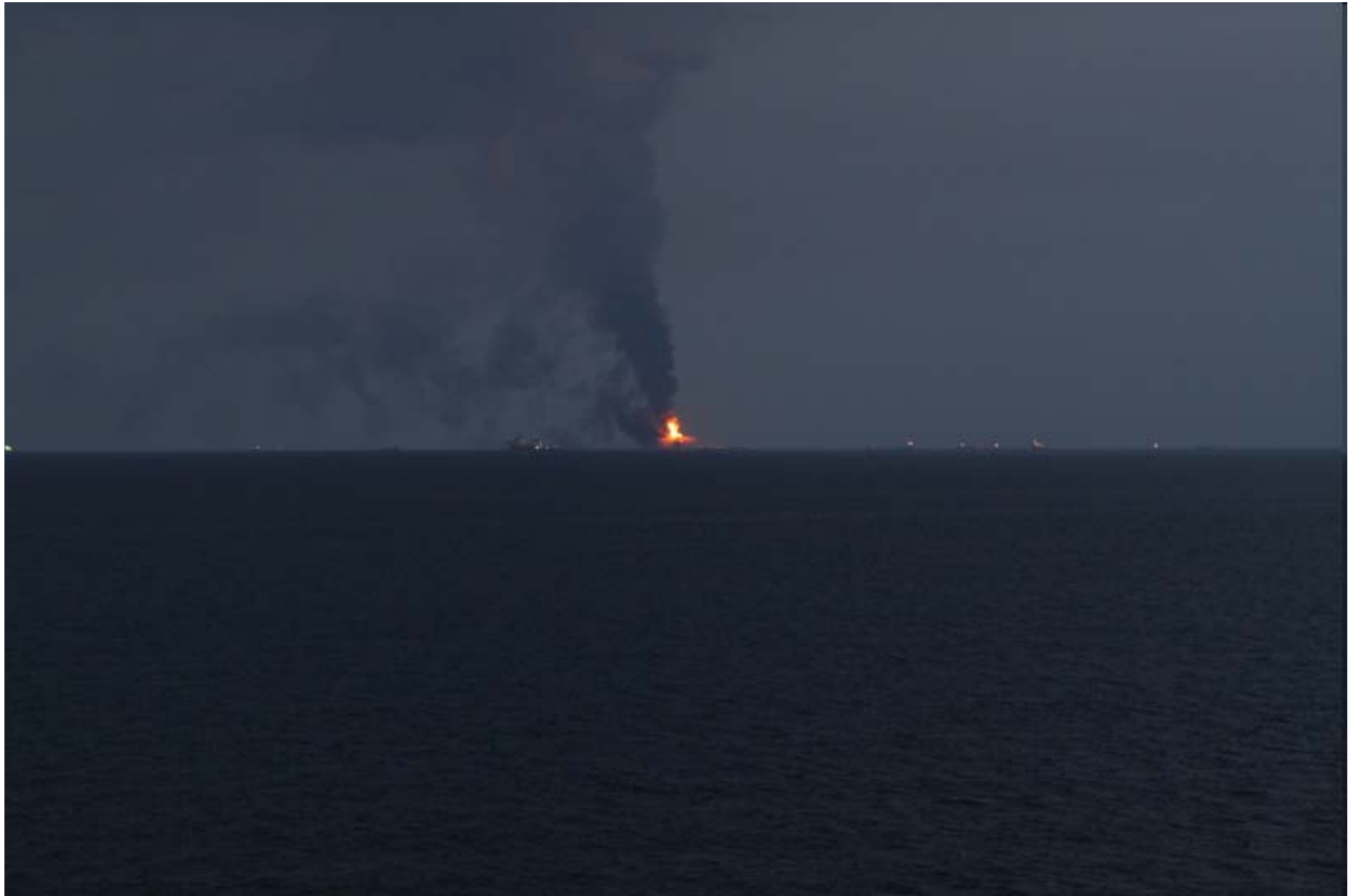
From about 10 miles away – dawn of Day 1