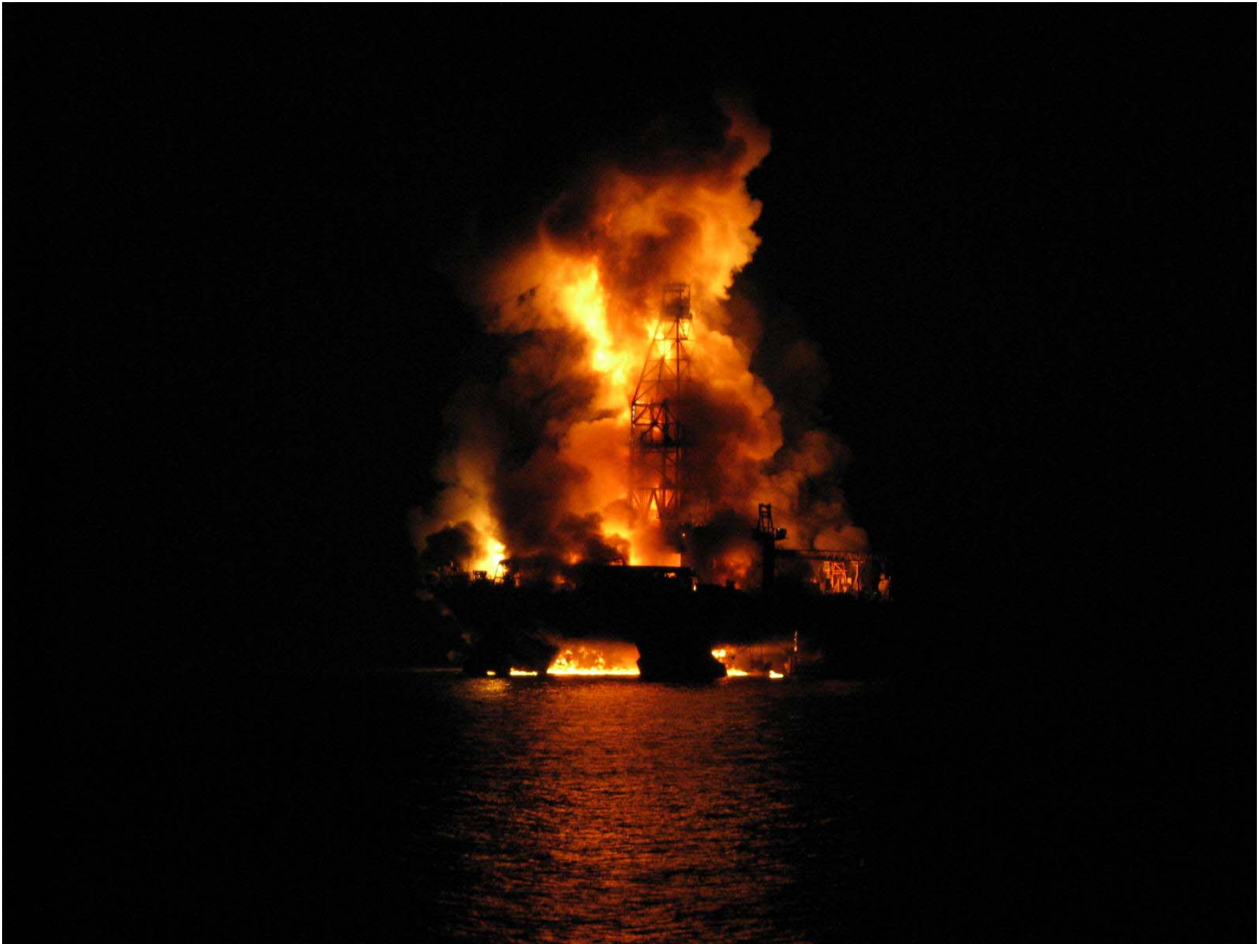
Taken shortly after the rig caught fire – the mast is still there