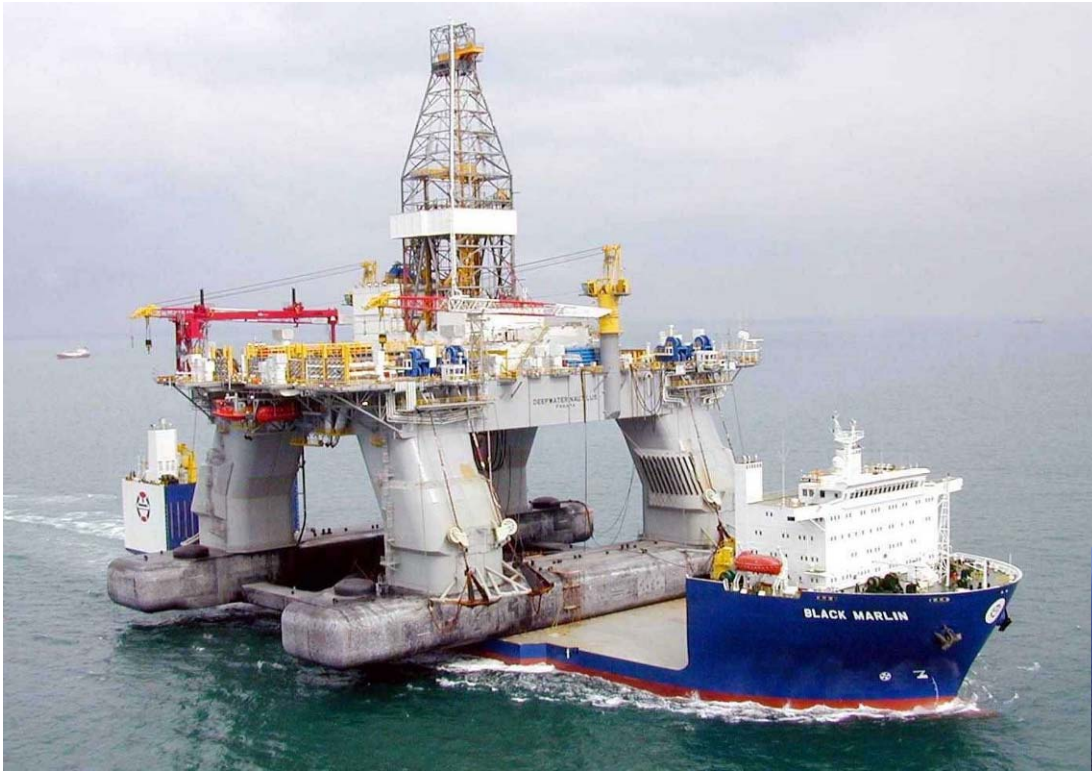
A sister rig, the Nautilus, being transported on a Heavy-Lift vessel