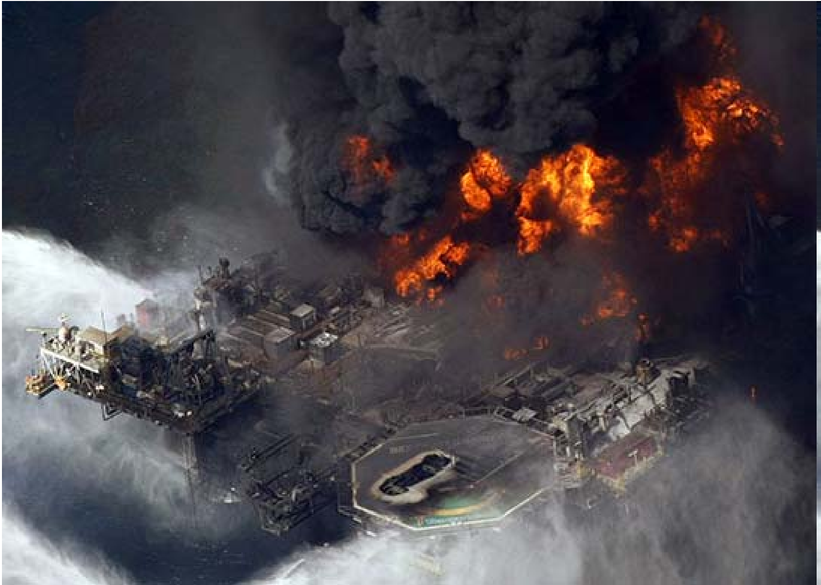
Early morning Day 2 – Note the hole burned through the aluminum helideck