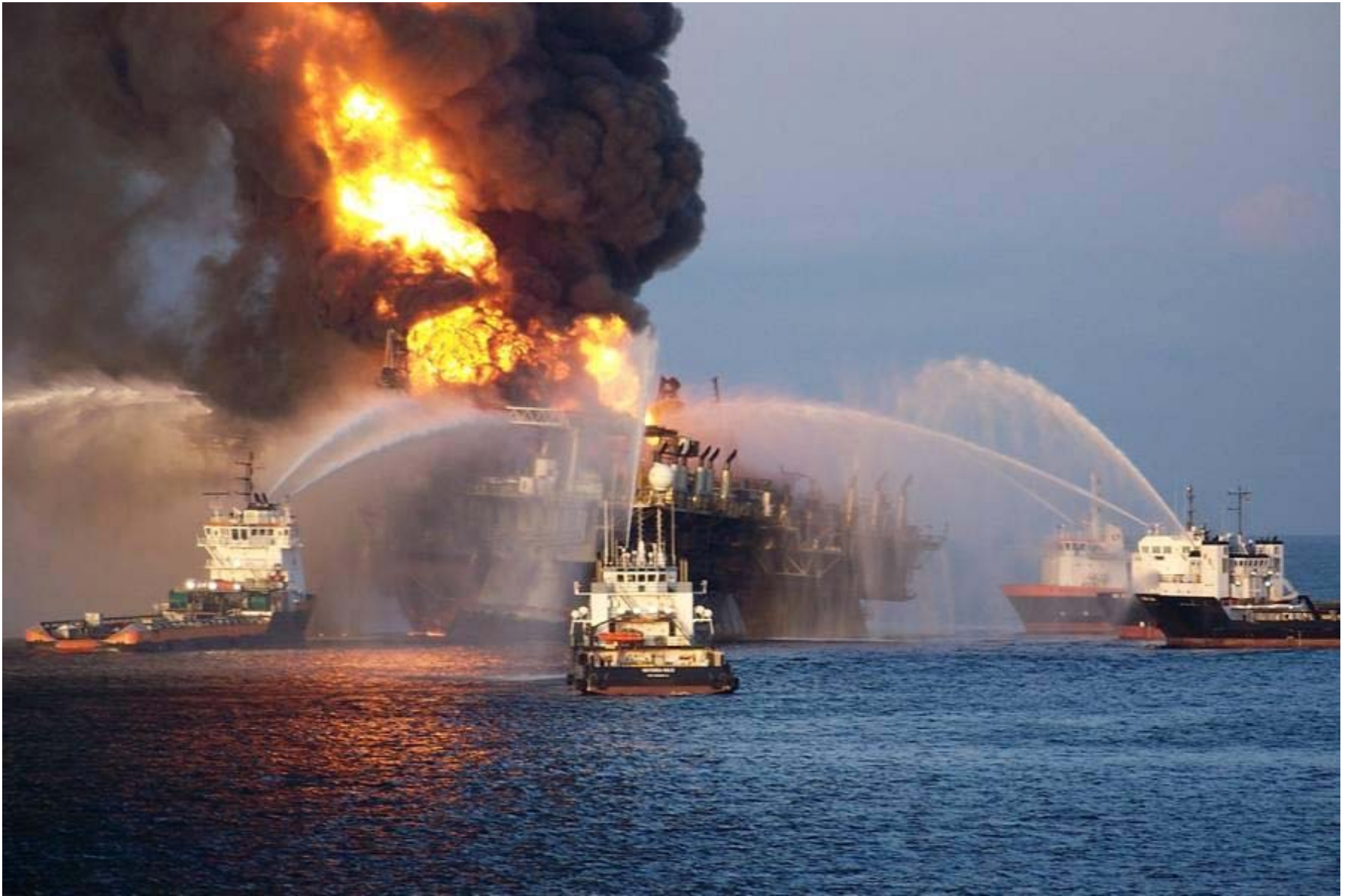
Support vessels using their fire fighting gear to cool the rig – note the list developing