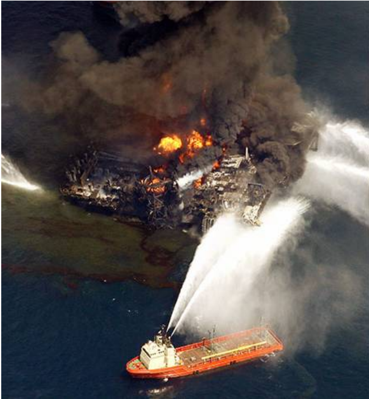
Day 2, morning – settling quite low in the water now – fuel and oil slick forming